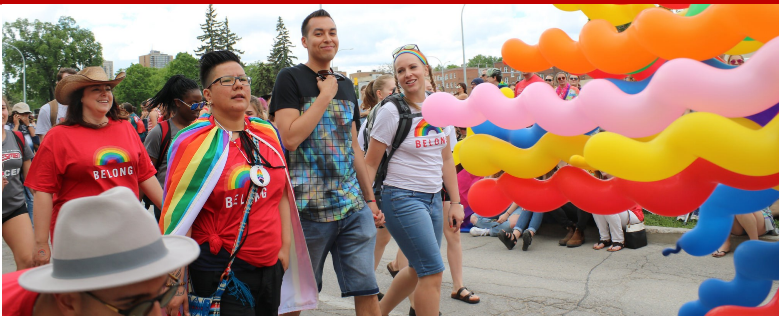
Pride Parade

August 15 — DEADLINE to submit an application to the Senator Thomas Crerar Scholarship